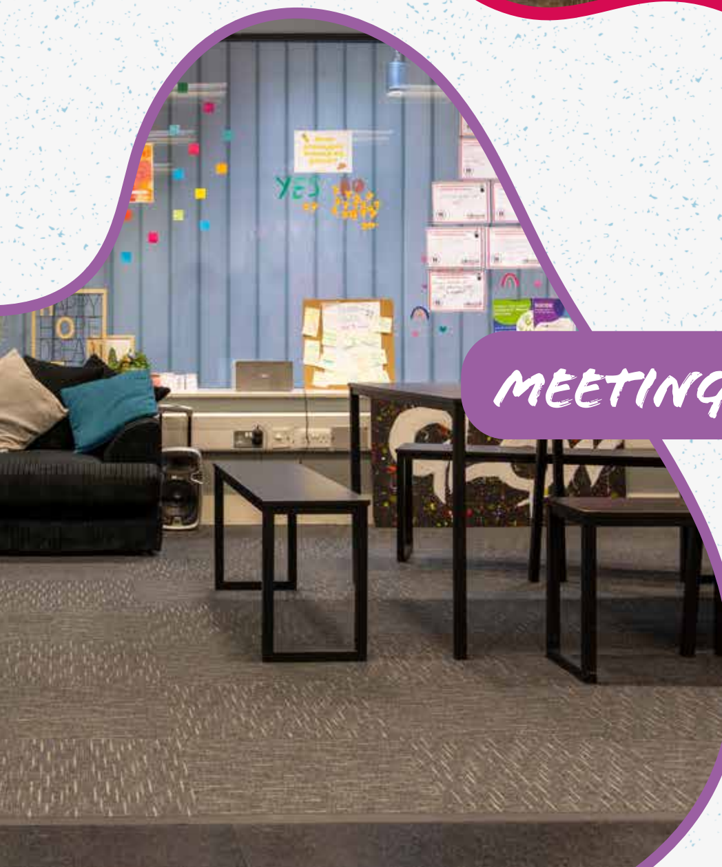
Table & Chairs Air Conditioning Sofa