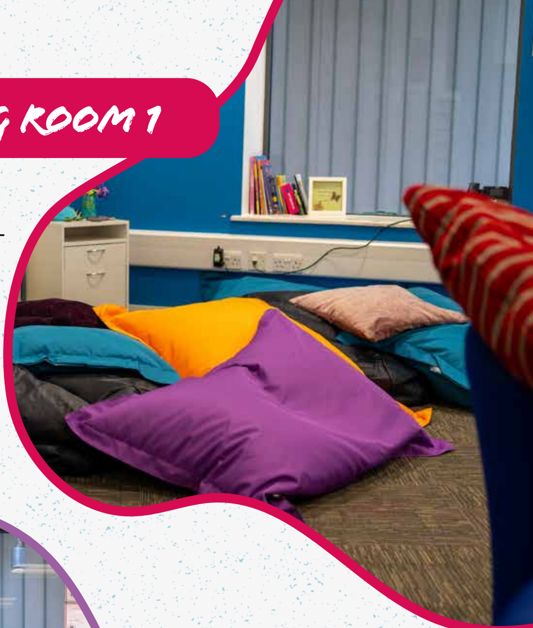
Table & Chairs Air Conditioning T.V. Screens Comfy Beanbags