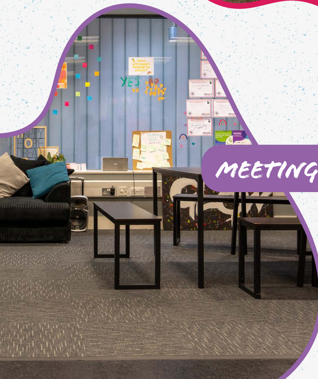
Table & Chairs Air Conditioning Sofa

Seating : 8 (plus additional break-out space)