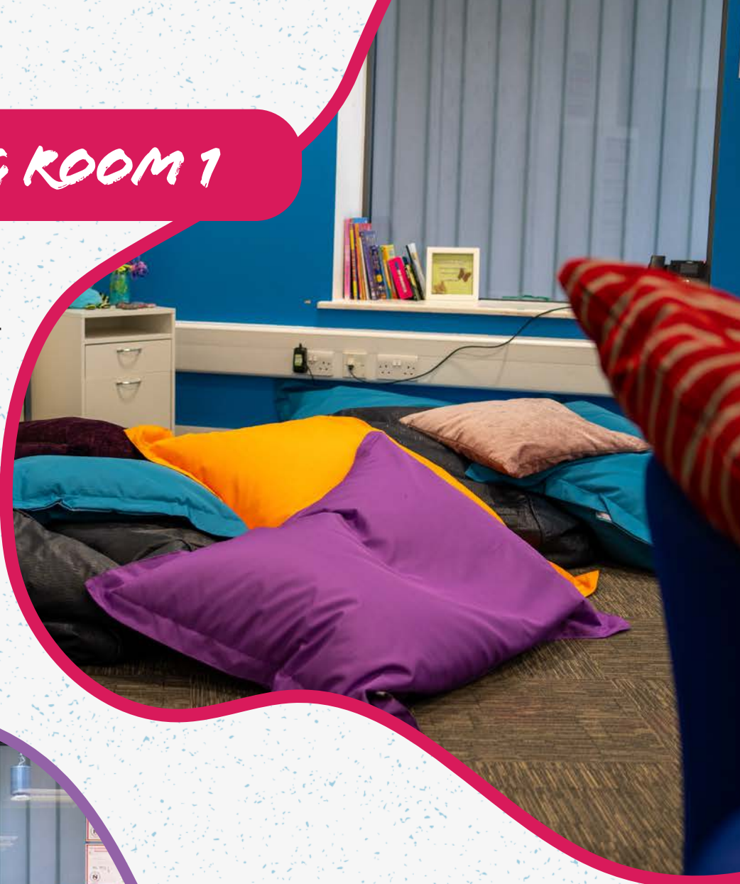
Table & Chairs Air Conditioning T.V. Screens Comfy Beanbags

Seating: 8 (plus additional break-out space)